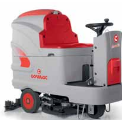
Innova 60 B