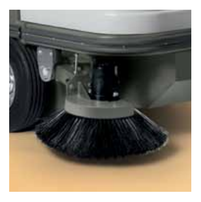
The side brush retracts in the event of accidental knocks, thus avoiding all possible damage. The brush's slanting angle can be adjusted to better adapt to cleaning along borders