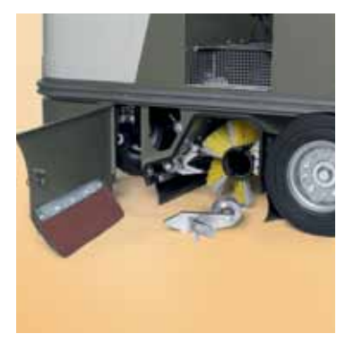
The pressure and height adjustment of the central brush are controlled simply by the knob near the brush. Brush height adjustment depending on wear can, therefore, be done very easily. This ensures a longer brush life cycle

A fabric bag filter, with a large filtering surface - 7 sq.m (CS80) - 8 sq.m (CS90-CS110) - lasts a very long time and ensures excellent results even in environments where there is a lot of fine dust thanks to the powerful filter shaker. The filter is easy to remove without the use of tools, to check or replace it. No maintenance is required thanks to the periodical use of the electric filter shaker. Filters in fabrics for specific applications are available upon request