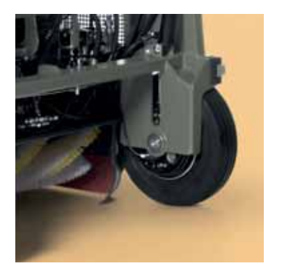
Besides reducing mechanical stress the large diameter wheels also make working more comfortable. Their sturdy support helps keep operating characteristics always the same.

Both versions have hydraulically controlled brakes as a standard feature