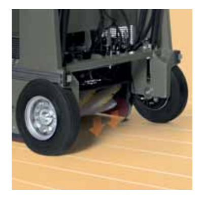
The central brush is the floating type and self-adjusts to keep in contact with the ground all the time